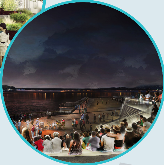
CONCERTS WILL RETURN TO PIER 62, A FLEXIBLE ACTIVITY SPACE