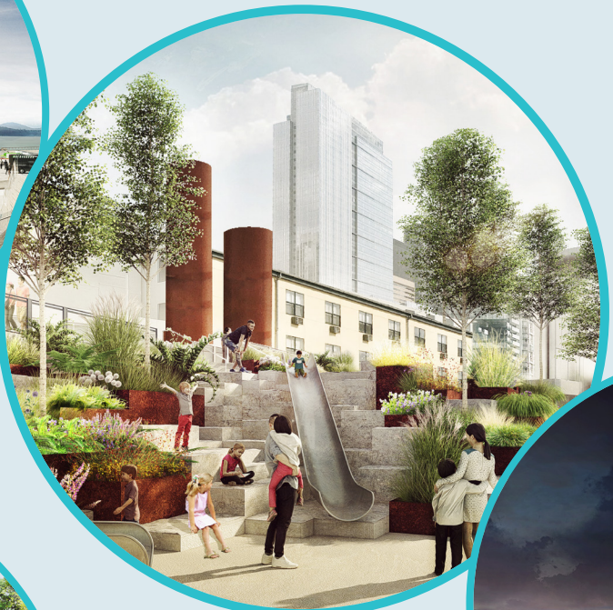
BLUFF WALK SLIDES, PART OF THE OVERLOOK WALK