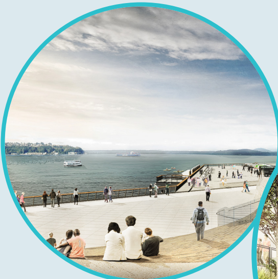
BAY STEPS AT OVERLOOK WALK WHICH WILL CONNECT THE WATERFRONT AND PIKE PLACE MARKET