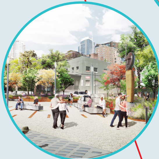
A PORTION OF THE PROMENADE—WHICH SPANS THE LENGTH OF THE FUTURE WATERFRONT PARK—AS SEEN FROM PIER 58