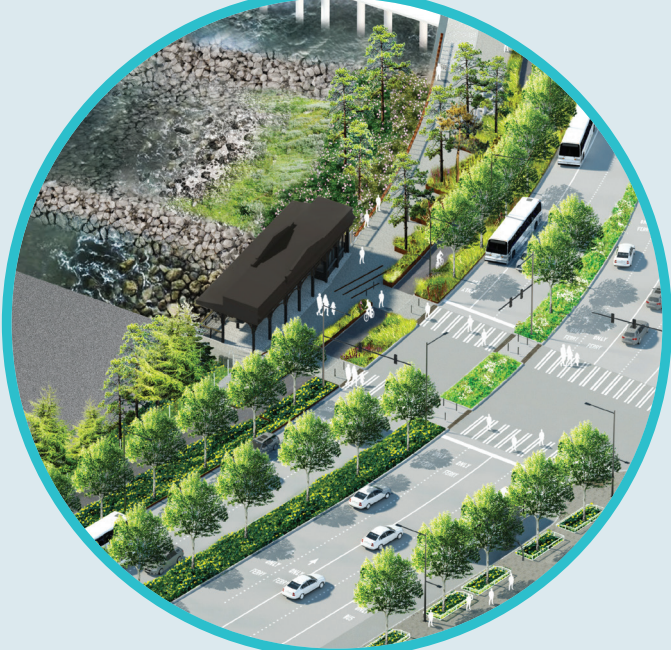
THE HABITAT BEACH NEAR PIONEER SQUARE WILL MAKE ELLIOTT BAY ACCESSIBLE. THE WIDE EXPANSE OF ALASKAN WAY IS IN THE FOREGROUND