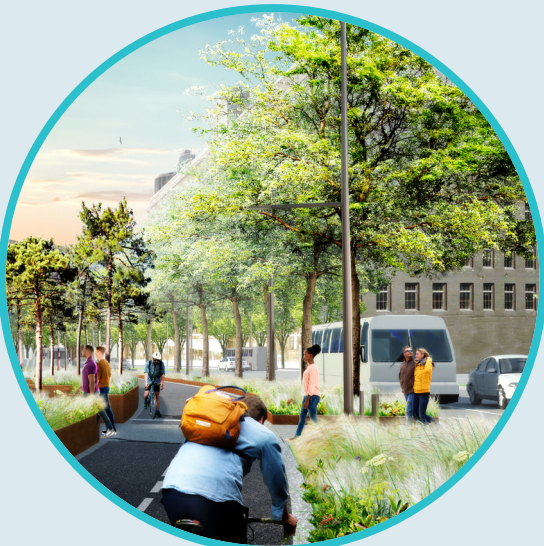
A NEW TWO-WAY PROTECTED BIKE LANE WILL RUN FROM S KING STREET TO PIER 62